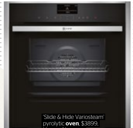
'Slide & Hide Variosteam' pyrolytic oven , $3899, Harvey Norman, harveynorman.com.au .