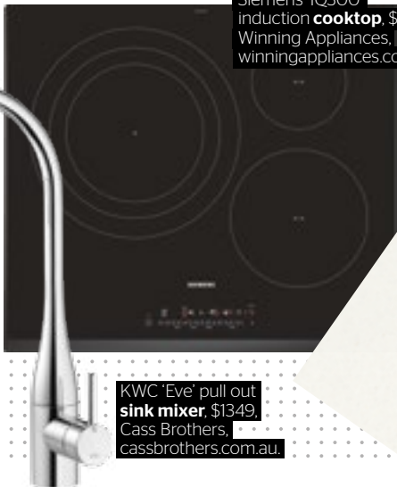
Siemens 1Q300 ® induction cooktop , $1999, Winning Appliances, winningappliances.com.au .