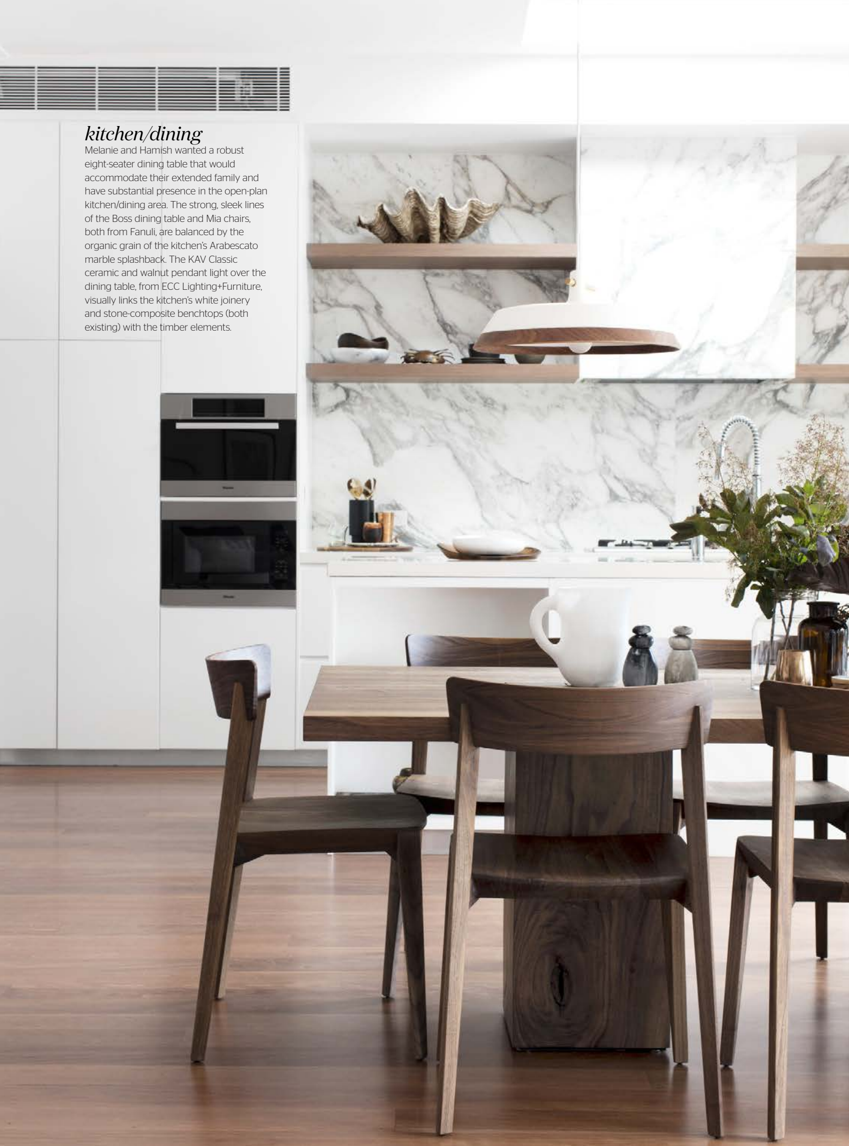
ADDITIONAL PRODUCT SOURCING: NATALIE JOHNSON

Melanie and Hamish wanted a robust eight-seater dining table that would accommodate their extended family and have substantial presence in the open-plan kitchen/dining area. The strong, sleek lines of the Boss dining table and Mia chairs, both from Fanuli, are balanced by the organic grain of the kitchen’s Arabescato marble splashback. The KAV Classic ceramic and walnut pendant light over the dining table, from ECC Lighting+Furniture, visually links the kitchen’s white joinery and stone-composite benchtops (both existing) with the timber elements.