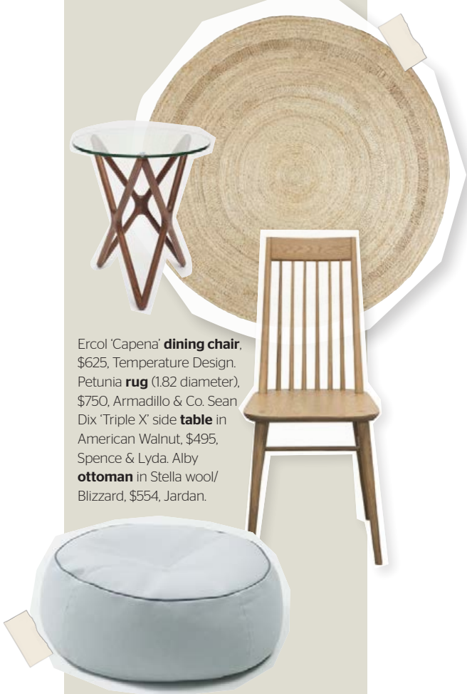
Ercol ‘Capena’ dining chair, $625, Temperature Design. Petunia rug (1.82 diameter), $750, Armadillo & Co. Sean Dix ‘Triple X’ side table in American Walnut, $495, Spence & Lyda. Alby ottoman in Stella wool/Blizzard, $554, Jardan.

Hamish and Melanie’s preference for natural materials comes together in the living room. Key furnishings are neutral-toned but textured – a wool rug, linen upholstery for the sofas, a tan leather ottoman – and teamed with sculptural timber furniture and lighting. Hellen introduced colour via accent cushions and palm tree-themed artworks, the green hues picking up on the verdant views through the floor-to-ceiling windows. Statement Brunschwig & Fils Feuillage wallpaper in the entrance expresses the couple’s personality and hints at the delights to come.